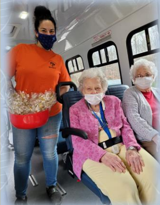
Senior Living Residents drop off homemade dog biscuits at the Orange Animal Shelter