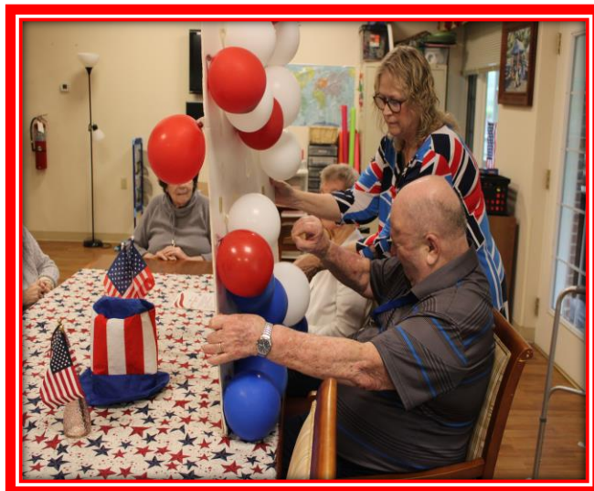
Memorial Day Balloon Pop was a hit!