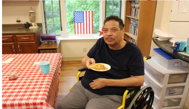
Wine & Design is a favorite!