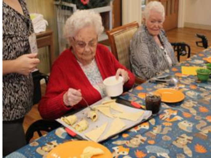
Residents made delicious apple pie bites