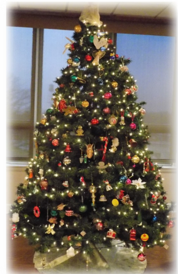
Dogwood Village Angel Tree