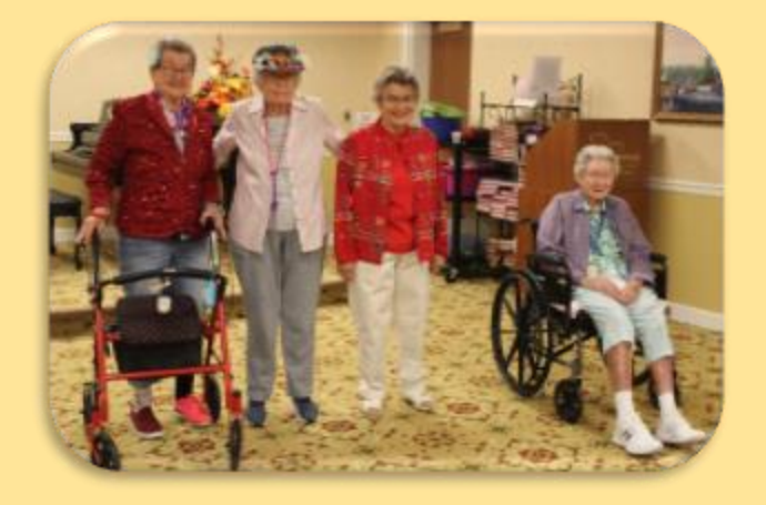
GAUDY PARTY HIGHLIGHT